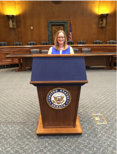
What do you all think? Senator Clare Lindahl?