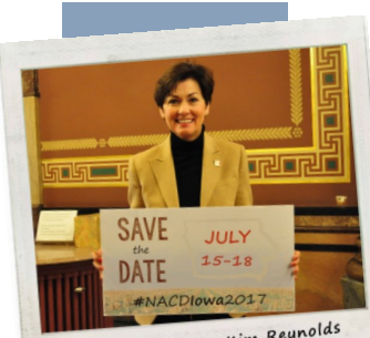
Iowa Lt. Governor Kim Reynolds Incoming First Woman Governor of Iowa