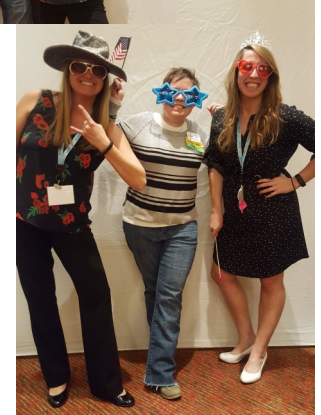
Just for fun!