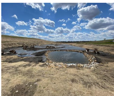
Clockwise: Planting trees in Adair County; Taylor County demonstration plot; surveying in Polk County; recently installed wetland Polk County; Marion County installing waterway project.