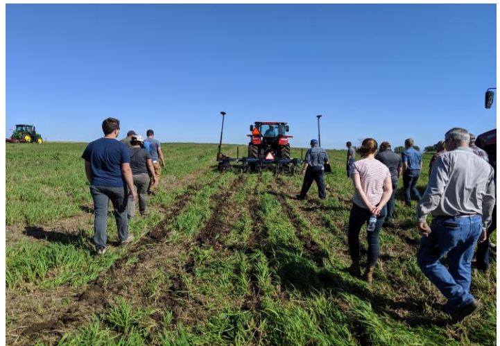
Strip tillage demonstration

The Iowa Farm Environmental Leader Award is a joint effort of the Governor, Lt. Governor, IDALS, and Iowa Department of Natural Resources to recognize the exemplary voluntary efforts of Iowa's farmers as environmental leaders committed to healthy soils and improved water quality. It recognizes those that have taken steps in their farming operations that improve or protect the environment and natural resources of our state while also serving as local leaders to encourage other farmers to follow in their footsteps by building success upon success. As environmental leaders, these farmers have adopted best management practices and incorporated environmental stewardship throughout their farming operations. Nomination forms for Award Year 2020 are due Friday, May 22 nd . For details and nominating forms, please log on to Iowa Farm Environmental Leader Awards .