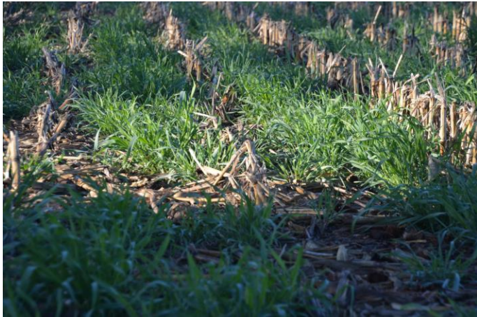
ISA cover crop management field test