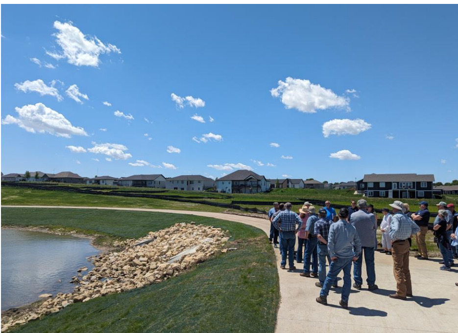
Discussing the Sioux Center Wet Pond urban conservation structure project. The detention pond holds excess water, improves water quality and provides a community amenity.

The annual State Soil Conservation and Water Quality Committee (SSCWQC), in partnership with CDI, held their annual "Conservation Summer Tour" on June 10 th in Northwest Iowa. The tour viewed local conservation efforts. Tour stops included: The Northwest Research and Demonstration Farm near Sutherland, focusing on early bioreactor research successes; in Rock Rapids, the Lyon & Sioux RWS tests for more than 76 constituents to maintain quality water for communities; the Sioux Center Wet Pond detention basin slows and cleans water before it reaches the local creek, a project the Iowa Department of Natural Resources had contributed funds toward which also offers the city a local recreation area.