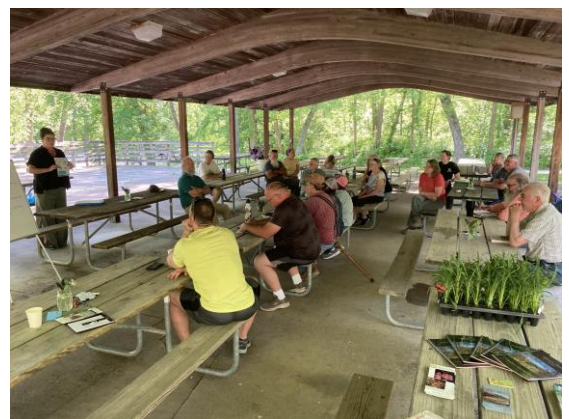
Reviewing plans for the day at the May ‘Life’ event.